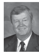
Gary Blair Texas A&M