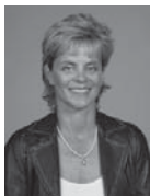
Kim Mulkey Baylor