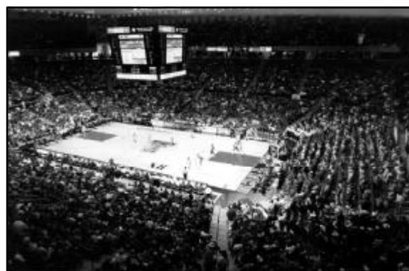
Texas Tech consistently ranks in the Top Five for national attendance.

!Was an All-Time NCAA Division I high before the Big 12 set the record again in 2000-01.